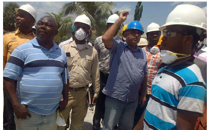
Technical visit to Ibeto Cement Company Ltd on 2nd May 2013