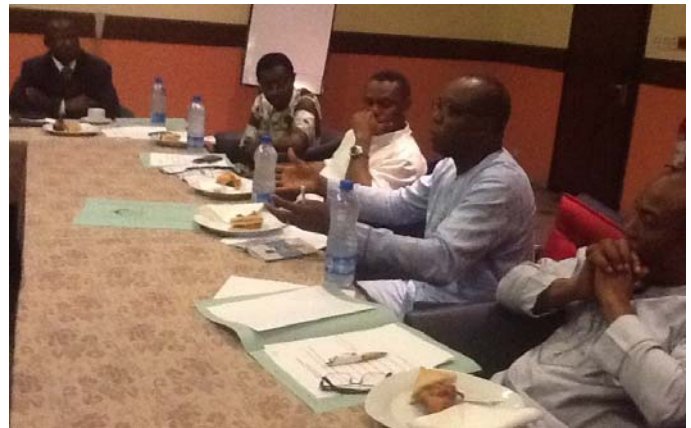
Inauguration of Engineering Collaboration/ Business Integration Committee on May 1st 2013 at Hotel Presidential in Port Harcourt.