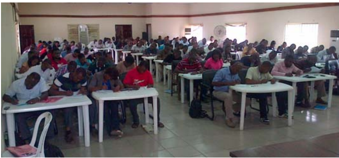
NSE Exams in progress at the NSE PH Branch Secretariat.